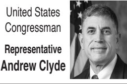
United States Congressman Representative Andrew Clyde

The Department of Justice's years-long investigation into Hunter Biden came to a head last week as the President's son reached a plea agreement on charges